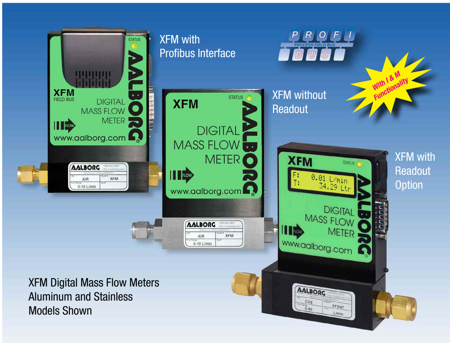
XFM Digital Mass Flow Meters Aluminum and Stainless Models Shown

* LCD display is not available for Profibus DP interface option.