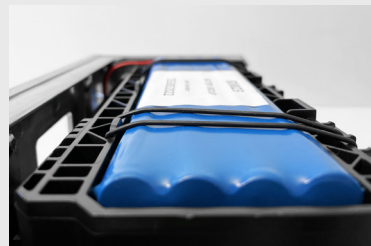
On-board batteries without automation changes on dimension.